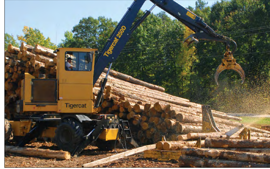
Optional bar and circle saw slasher hydraulic packages available for merchandising in the mill yard.

© 2001 - 2017 Tigercat International Inc. All Rights Reserved. TIGERCAT, WIDERANGE, TURNAROUND, ER, EHS, and TEC, their respective logos, TOUGH RELIABLE PRODUCTIVE, TIGERCAT TV, "Tigercat Orange" and BETWEEN THE BRANCHES, as well as corporate and product identity, are trademarks of Tigercat International Inc., and may not be used without permission. TIGERCAT, TURNAROUND, and ER, and their respective logos are registered trademarks of Tigercat International Inc