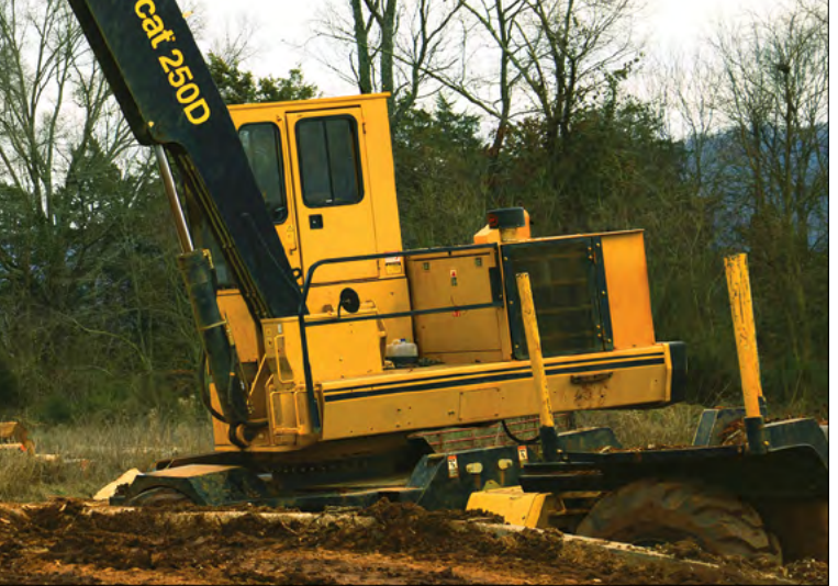
Optional bunk and stakes for additional carrying capacity. Combined with a trailer, the AC16 has the potential to quickly move large volumes of timber around the yard.

With powerful tractive effort and optional hydraulic packages for auxiliary equipment, the AC16 articulating carrier increases versatility and expands the range of duties the loader can accomplish in mill yard applications.