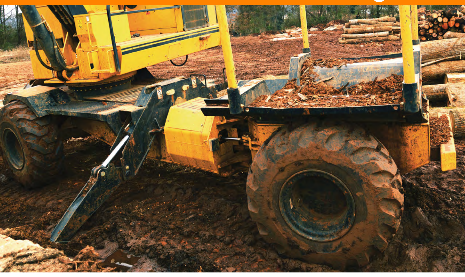
The AC16 articulating carrier is designed and built for mill yard duties with powerful tractive effort and durable construction throughout. Tigercat's WideRange® drive provides quick travel speeds without the need to shift gears.