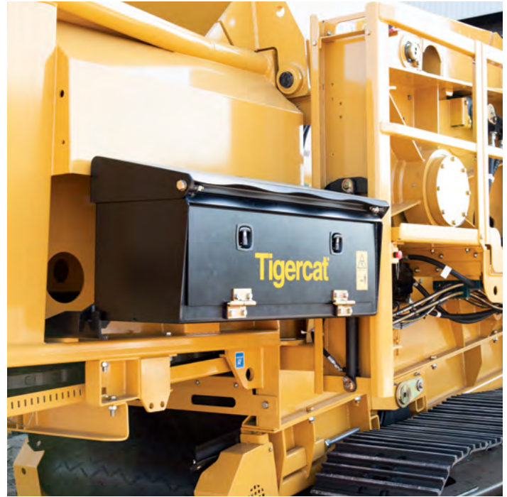
Toolbox that hydraulically raises and lowers.

THE ENTIRE UNDERSIDE OF THE DISCHARGE CONVEYOR IS OPEN TO PREVENT BUILD UP OF MATERIAL.