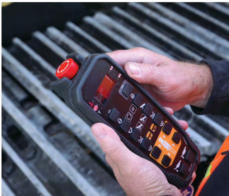
Remote control for easy machine functionality.